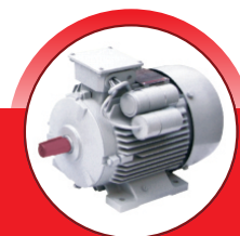
Heavy Duty German Technology Turbo Motor