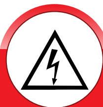
Electric Overload Protection