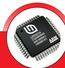
Digital Auto Control System